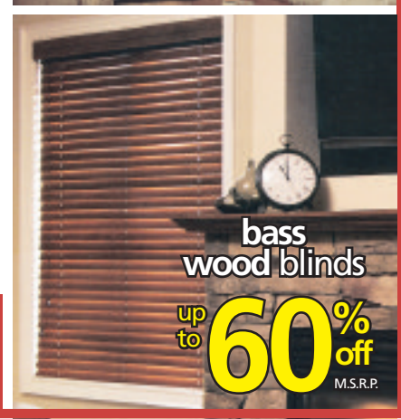
bass wood blinds