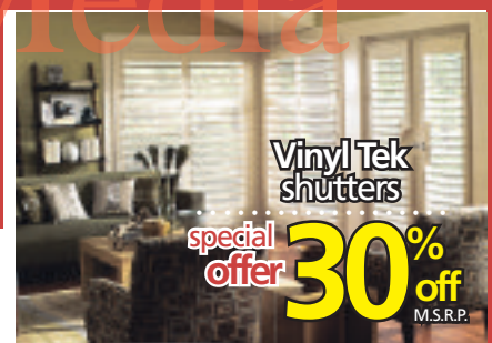
Vinyl Tek shutters

Call: 705.745.2133 or Toll Free: 1-800-268-1851