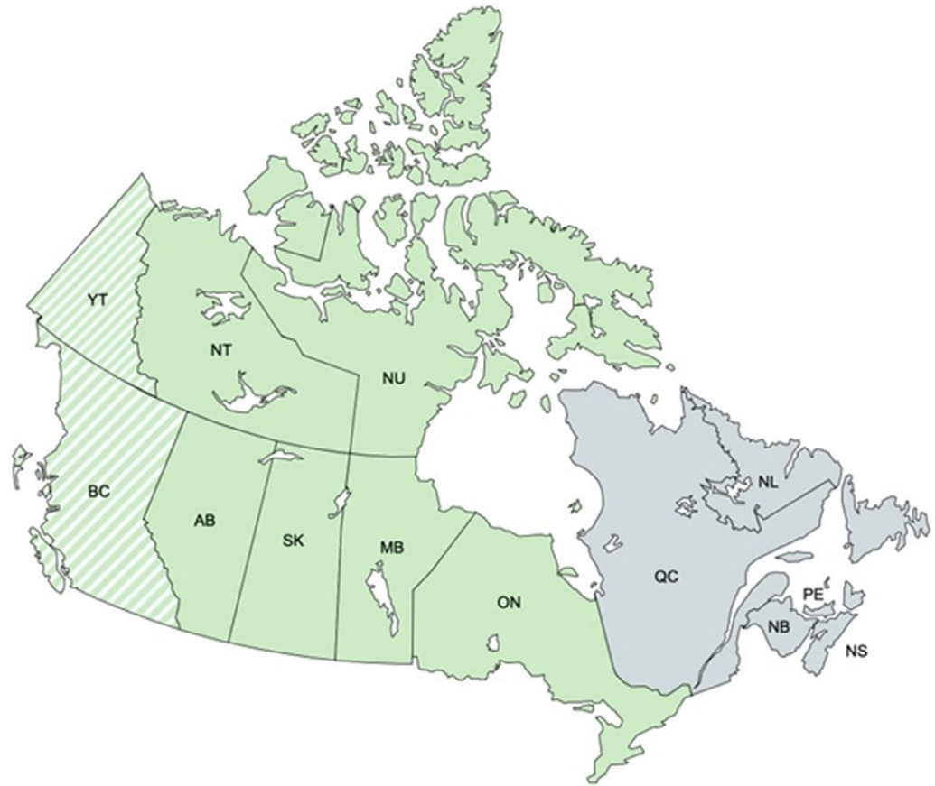
Figure 1: Newborn screening programs for SMA presently include 72% of Canadian newborns. Legend: Solid green = provinces and territories screening for SMA as of June 2022. Hatched green = BC and YT that began screening for SMA as of October 1, 2022. Grey = provinces that do not currently include SMA as part of their NBS panel. SMA = spinal muscular atrophy; YT = Yukon; NT = Northwest Territories; NU = Nunavut; BC = British Columbia; AB = Alberta; SK = Saskatchewan; MB = Manitoba; ON = Ontario; QC = Quebec; NL = Newfoundland and Labrador; NB = New Brunswick; PE = Prince Edward Island; NS = Nova Scotia. NB, NS, PE, NL, and QC have announced plans to initiate NBS screening for SMA, but no formal start date has been set at the time of publication. Provincial and territorial birth rates from Statistics Canada. 13 Figure was designed using MapChart. 24

I) experience a mean delay in the time from symptom onset to diagnosis of 2.5 months. 15 The mean delay to diagnosis for SMA type II, where symptom onset occurs between 6 and 18 months old, is over 12 months. 15 Delays to diagnosis were primarily attributed to patients having to visit multiple healthcare professionals to exclude other diagnoses prior to undergoing genetic testing for SMA. 15 Such delays in diagnosis represent a lost opportunity, particularly given the rapid and irreversible progression of SMA where the life expectancy ranges from a median of 8 months 16 to a mean of 10-1/2 months 17 for infants with SMA type I (typically 2xSMN2 copies) unless given continuous ventilator support and/or receiving disease-modifying therapy.